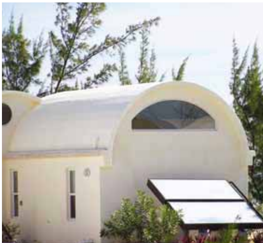
Resilient, cool, and self-sufficient. Hurricane-proof solar powered buildings.

Practical functions performed in a building are often quantifiable, such as manufacturing, recreation and residential housing.